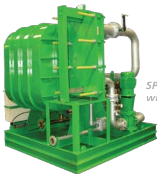
SPD35 Series Watermaker with steam heating loop