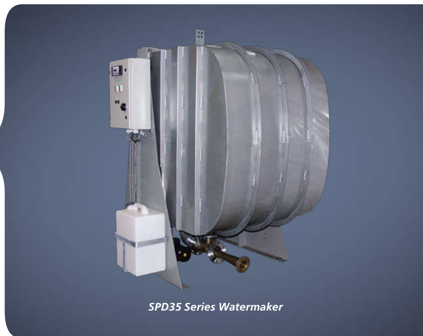
SPD35 Series Watermaker