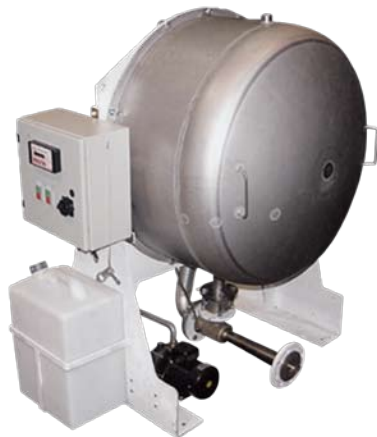
SPD13 Series Watermaker